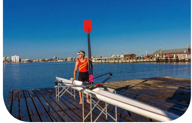
ABOVE: A grant allowed the 1905 WA Rowing Club, Perth, to replace the piling under the rear deck and refurbish the platform, which was critical to its continuous use as a rowing club.