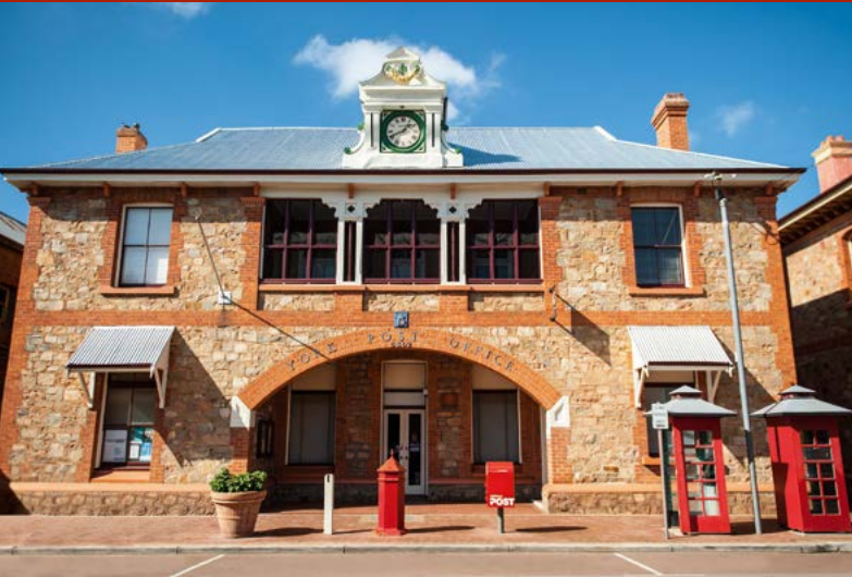
ABOVE: The 1893 York Post Office was conserved and the original clock, one of the oldest public clocks in WA, restored to working condition with the help of a heritage grant.