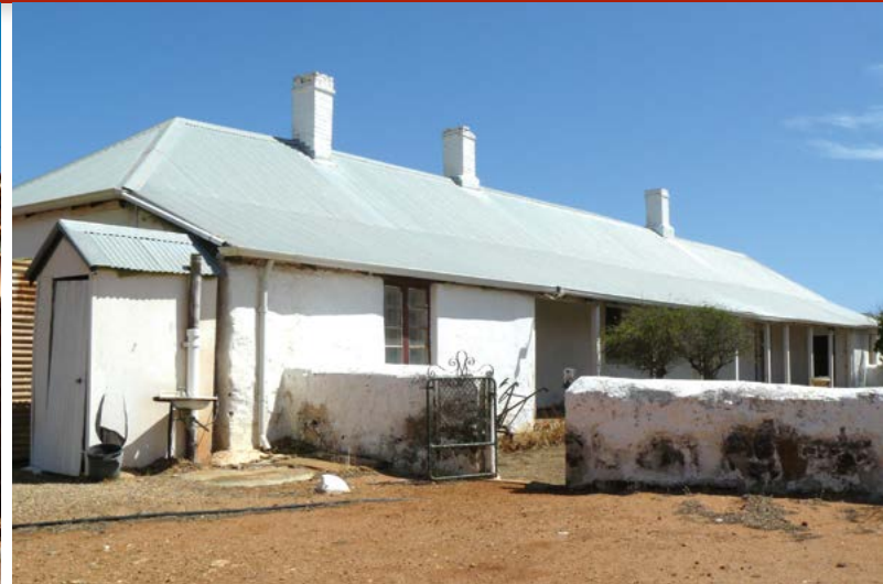
ABOVE: 1860s Oakabella Homestead, Northampton, received a heritage grant to develop a Conservation Management Strategy which helped identify the maintenance required for its sustainable future.

The Heritage Grants Program offers assistance to private owners of State Registered heritage places to commission Conservation Management Plans or Strategies, or undertake urgent conservation works.